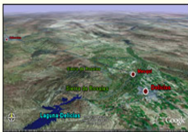
Delicias a Chihuahua