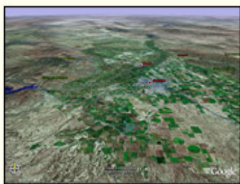
Delicias y Meoqui