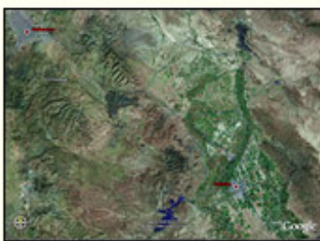
Delicias a Chihuahua